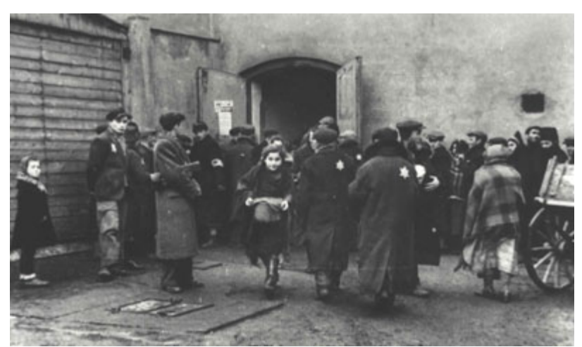
A soup kitchen in the Lodz ghetto.