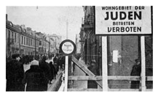
The entrance to the Lodz ghetto. The sign reads "Jewish residential area entry forbidden."